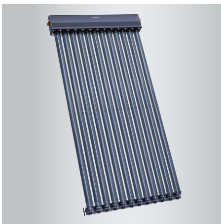
Vitosol 300-TM high-performance vacuum tube collector (type SP3C)