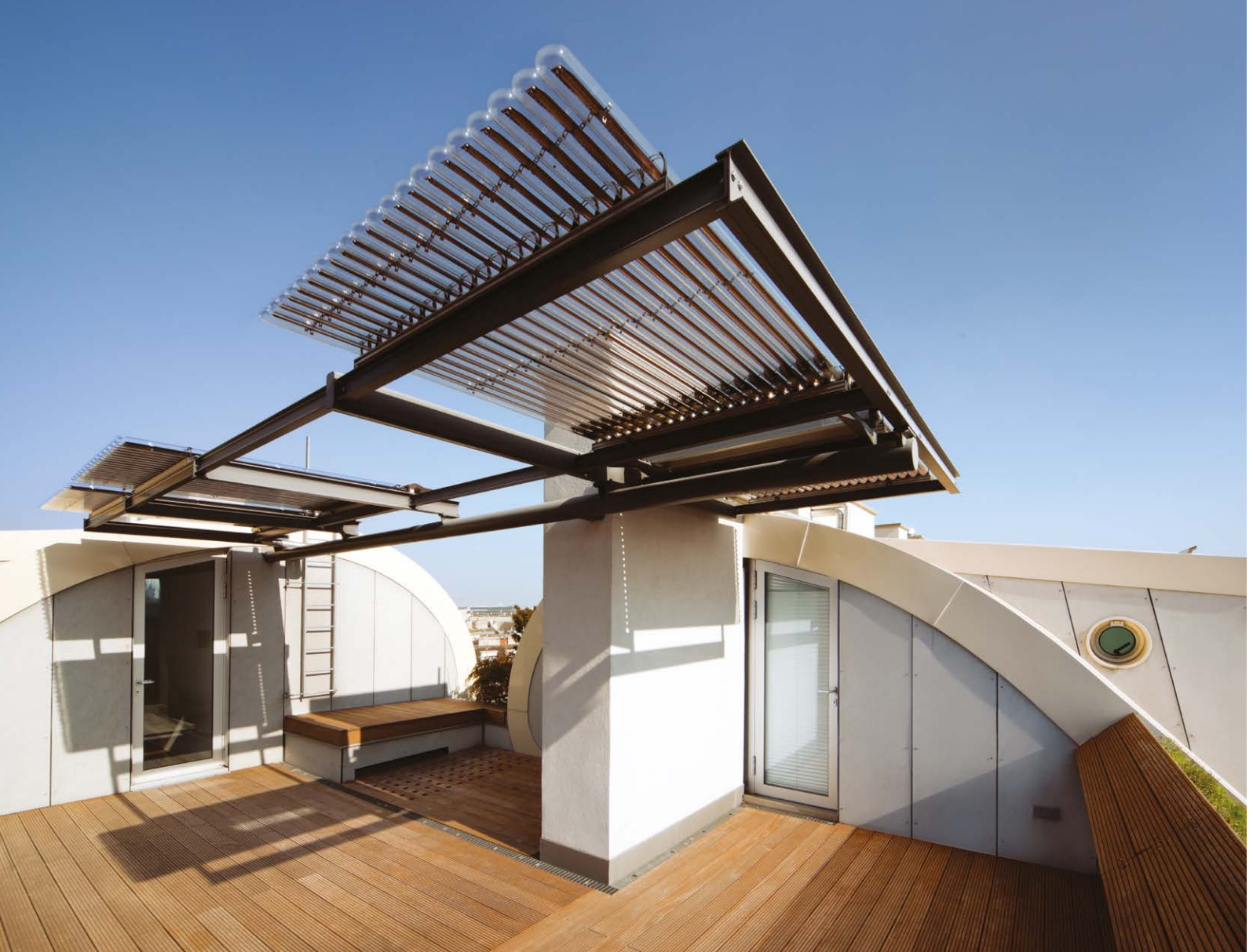
Vitosol 300-TM offers universal application possibilities