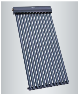
Vitosol 300-TM vacuum tube collector