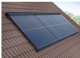
Can be installed vertically, horizontally, on roofs, on building facades as well as free-standing.

With the Vitosol 300-TM, Viessmann offers a high-performance vacuum tube collector that meets the highest demands in terms of efficiency and safety.